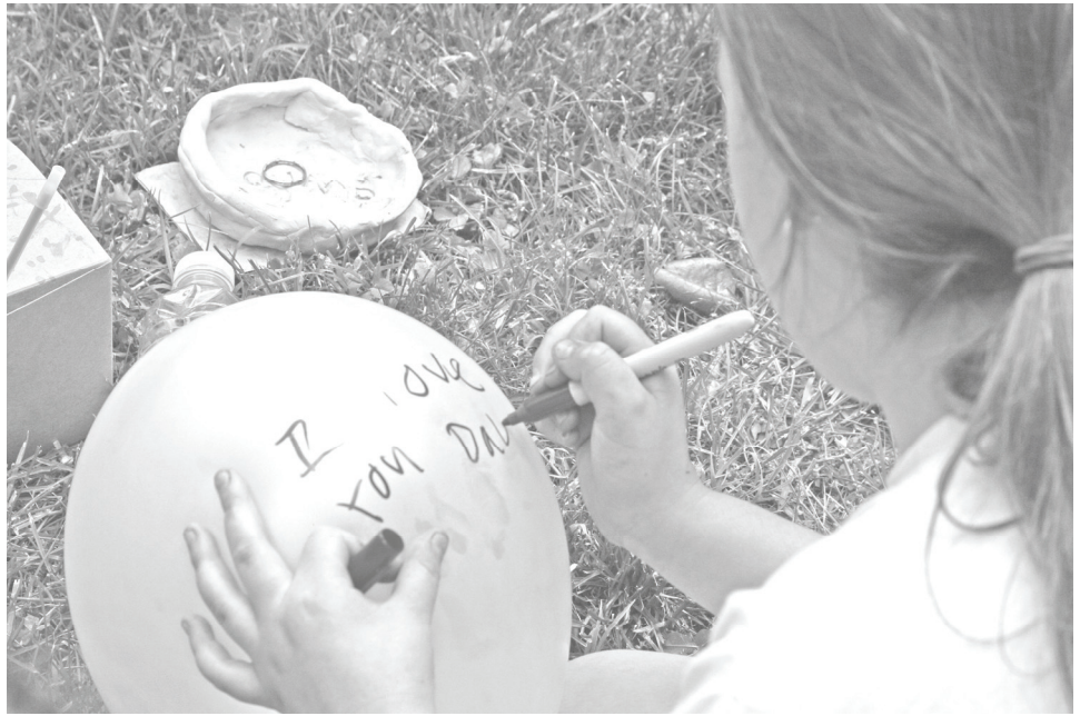
At Journeys thru the Seasons Spring 2008 Camp, a camper prepares a message to her loved one, prior to the balloon release closing ceremony.

It is natural that parents want to protect their children from the effects of personal tragedy, but the best way to do this is to help them express their grief, not deny it. Time and again, I have seen misbehaving youngsters--especially boys--brighten up and start responding with enthusiasm when they were allowed to talk about their losses and to express